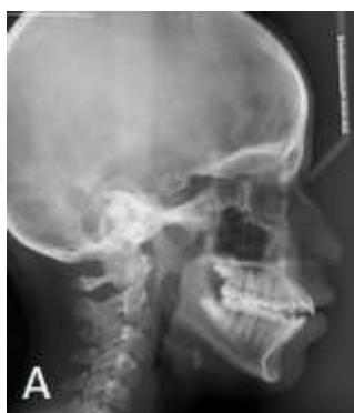
Fig. 3: A: Pre-treatment Orthopantomogram revealed no abnormalities.

(Table 1). Ashley-Howe model analysis indicated that expansion was possible in the upper arch. The Boltons analysis revealed relative anterior mandibular tooth material excess by 3.5 mm and relative overall maxillary tooth material excess by 6.2 mm