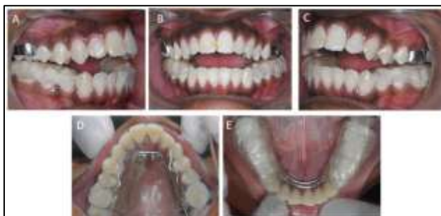
Fig. 4: Customized quad helix with acrylic covering on I quadrant to allow unilateral expansion on the left.

The treatment commenced with banding of upper 1 st molars and quad-helix fabricated of 0.036-inch stainless steel wire was soldered to the bands for crossbite correction. The lingual arms were extended bilaterally up to the canines and helices were placed as anteriorly possible. To reinforce anchorage acrylic was added to the quad helix on the non-cross bite to harness the palatal soft and hard structures. Anticipating some amount of palatal tissue irritation, a soft liner was added over the palatal surfaces. Simultaneously, lower posterior bite was inserted to open the bite to facilitate crossbite correction without resistance. The quad helix was preactivated unilaterally, such that the molar bands on the cross-bite side were half-way past the buccal surface of the upper left 1 st molar (Fig 4. A, B, C, D, E).