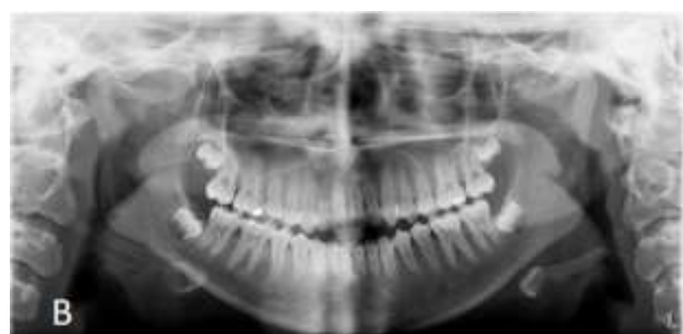
Fig 3 B: Pre – treatment OPG and Lateral Cephalogram

dimensions were within the normative values. (Table 2) (Fig. 3. B).