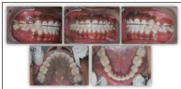
Fig. 8: Post – treatment intra-oral photographs

Following deboning, retention regimen consisted of Bag's wrap around retainer with tongue-crib for the upper and bonded lingual retainer for the lower (Fig 8. A, B, C, D, E).