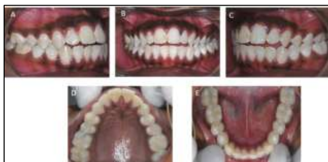
Fig. 2: Pre – treatment intra-oral photographs

The maxillary dental midline was coincident with the facial midline. The lower dental midline was shifted to the left by 2mm with respect to the maxillary dental midline. Intra-oral examination revealed a tapered maxillary arch with unilateral posterior crossbite on left side and ovoid mandibular arch with imbrication in lower anteriors. The canine relationship was end-on relationship on the left side and class I on the right side. Molar relationship on left couldn't be established because of the cross-bite. The patient had an anterior open bite (3 mm) and an overjet of 2mm (Fig. 2. A, B, C, D, E).