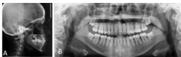
Fig. 9: Post – treatment OPG and Lateral Cephalogram

Post-treatment study models demonstrated an increase in the maxillary inter-canine, inter-premolar and inter-molar width with attainment of ideal overjet and overbite (Table 1). Post-treatment OPG revealed no abnormalities and no signs of root resorption (Fig. 9. A).