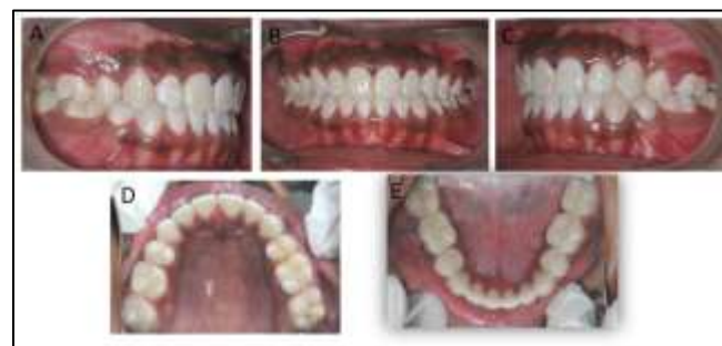
Fig. 7: Post – treatment intra-oral photographs

The treatment outcome at the end of active orthodontic treatment was excellent in terms of intercuspation, arch coordination and midlines. At the end of 18 months of active treatment, the appliance was deboned in a class I canine and class I molar relationship (Fig 7. A, B, C, D, E).