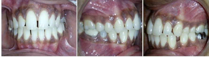
Fig. 1(A): Pretreatment intraoral photographs showing unilateral crossbite on left side.