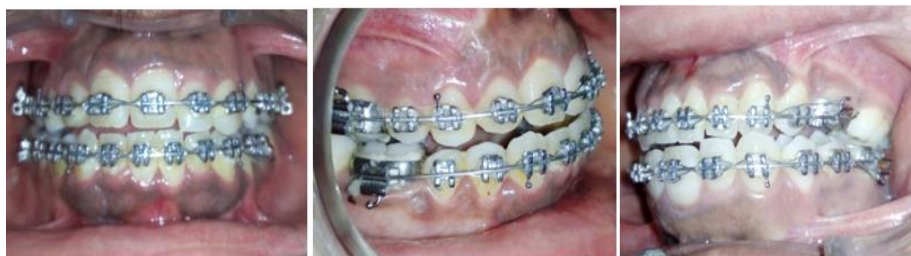
Fig. 2(D): The mid-stage treatment intraoral photographs