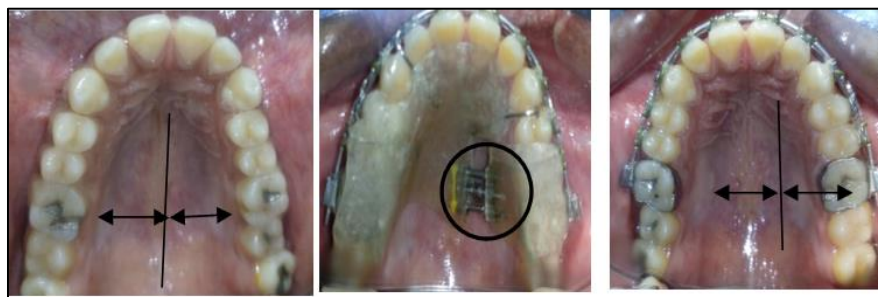
Fig. 1(C): Showing Maxillary arch expansion on right side