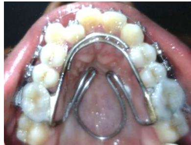
Fig. 2(B): The modified coffin spring appliance for correction of anterior crossbite