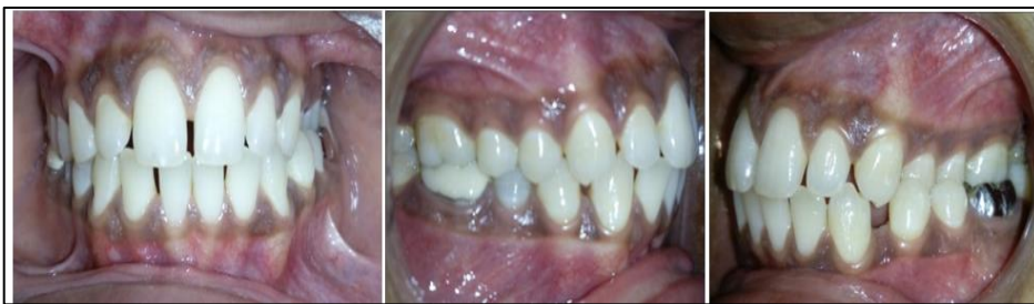
Fig. 1 (B): Pretreatment intraoral photographs showing unilateral crossbite on right side