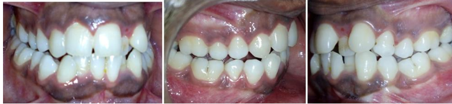
Fig. 2(A): Pretreatment intraoral photographs showing anterior crossbite on left side and bilateral posterior crossbite

A 21-year-old male patient was referred to our department with complaint of irregular teeth in maxillary and mandibular arch. On examination, the patient had a straight profile, competent lips, anterior crossbite irt 12, bilateral posterior crossbite and asymmetric maxillary arch (Fig. 2 A). Maxillary arch expansion was planned with modified coffin spring with overlapping of anterior arms for palatally placed lateral incisor (Fig. 2 B) and was soldered to maxillary first molar bands.