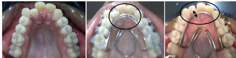
Fig 2(C): Maxillary arch photographs: before, during and after expansion showing maxillary anterior expansion and correction of right lateral incisor