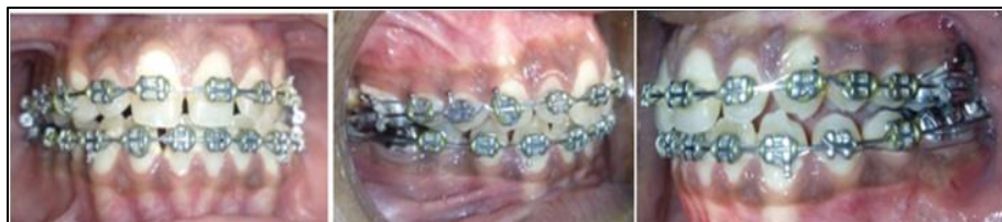
Fig. 1(D): The mid-stage treatment intraoral photographs depicting correction of posterior crossbite on right side