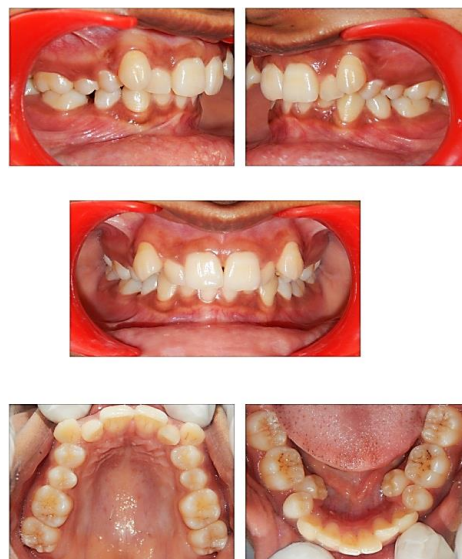
Fig. 1: Pre-treatment intraoral photographs

arch. Uprighting was planned with E-chain (from molar to lingual of premolar to canine) and open coil niti coil spring (between the canine and molar on 0.019x0.025 SS wire) to counter balance the forces of E-chain i.e. mesial force on molar and distal force on canine. lingual button was bonded on premolar to have good engagement of E-chain (Fig. 2) premolar was uprighted within 3 appointments and then finishing and detailing was done. The post treatment results are shown in Fig. 3.