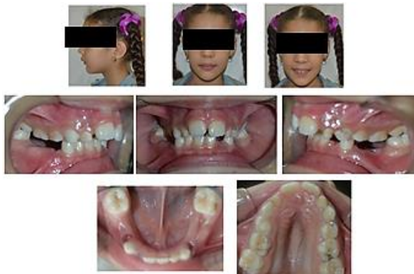
Fig. 3: Case presented after expansion