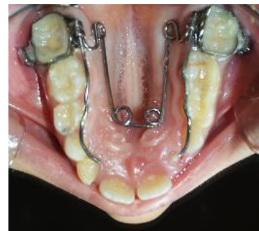
Fig. 5: The Quad Helix inserted in palatal sheath and the arch arms contacts all posterior teeth