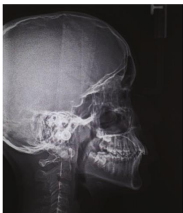
Fig. 1: Lateral cephalogram head film in natural head position and normal centric occlusion

point A, point B and point Gnathion (Gn). Thus, the points obtained on this vertical line by this geometric method were named as point R, point G and point C respectively (Fig. 2). The distance from point R to point A was measured and named as growth distance for maxilla. Similarly, the distance from point G to point B was measured and named as growth distance for mandible. And the distance from point C to point Gn was measured and named as growth distance for mandible. All these growth distance values for three age groups i.e. 9 to 11, 12 to 14 and 15 to 18 for both males and females were recorded in millimeters and comparisons were done between different age groups and also between males and females. Intra-examiner study error correction was done with 16 lateral cephalogram films that were randomly chosen and were retraced by the same examiner.