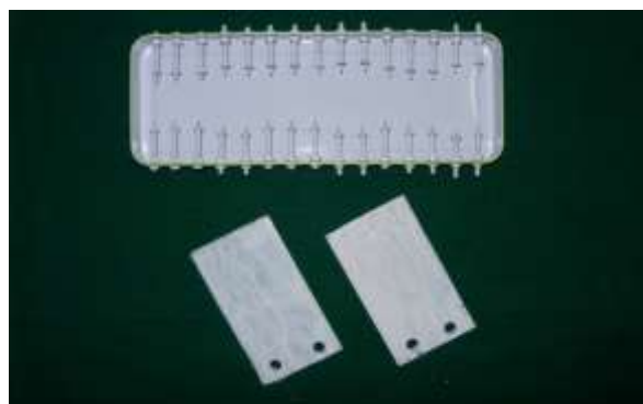
Fig. 1: Framework and jigs used in the study

Fig. 2 shows the bar graph representation of mean permanent elongation (percentage) of chain groups after 50% extension in air for 24 hours.