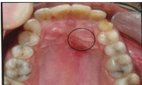
Fig. 1: Mucosal bulge on the palate depicting impacted canine

Clinical examination: The following clinical signs are indicative of impactions which are presence of mucosal bulge (buccal or palatal) (Fig. 1), delayed eruption of permanent teeth, prolonged retention of deciduous teeth and the mesial and distal tipping or migration of adjacent teeth. Palpation compounds our understanding as a widening of labiolingual plates indicates presence of tooth at this level and narrowing indicates absence at this level. Moreover, hard swelling in the place where a shallow depression on either side of the anterior nasal spine is expected in case of dilacerated or impacted incisor. Palpation of a dilacerated central incisor is often made in two places, one being high in the upper labial sulcus and the other as a small and hard lump in the palate.