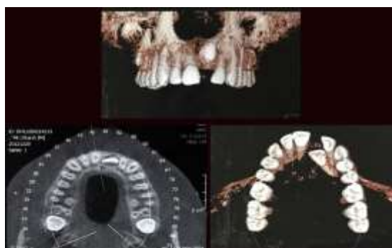
Fig. 3: Cone beam computed tomography images of impacted central incisor