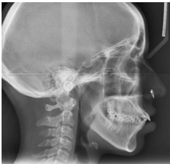
Fig. 2: Lateral cephalogram