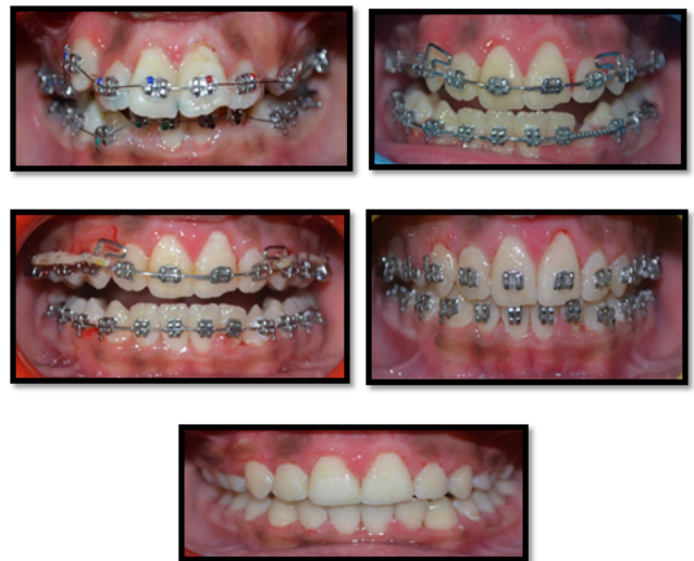
Figure 2: a, b, c, d Treatment images

Successful results were achieved with functional aesthetics and to prevent relapse retainers was provided. Patient was given instructions to maintain proper oral hygiene after treatment and was under follow-up for 10 years.