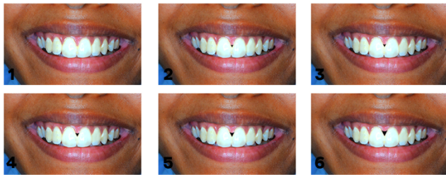
Figure 1: Altered black triangle between the maxillary central incisors in 0.5 mm increments. 1) No black triangle 2) 0.5mm; 3) 1.0 mm; 4) 1.5 mm; 5) 2.0 mm; 6) 2.5 mm.

Table 8 shows that the smile esthetic perception among different age groups was compared. The comparison revealed that laypeople with 18-35 yrs have given more scores for the Black triangle with 0 mm and gingival display with 2 mm compared with the 36-50 yrs group and has shown statistically significant results between both age groups. Comparison of images among different age groups does not show significant results.