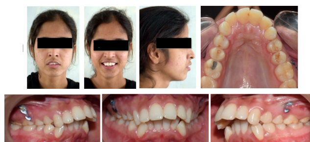
Fig. 5: Improvement achieved after maxillary posterior intrusion for 7 months.

Extraction of maxillary first premolars and mandibular single incisor was done. An initial 0.016-inch round nickel titanium arch wire was used for the levelling and the