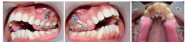
Fig. 3: The modified appliance placed in the patient's mouth.

a power chain to the hooks of the appliance and the hook of zygomatic implant, 400gms of force was applied on both the sides.