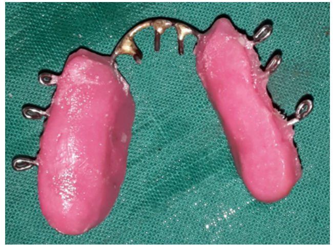
Fig. 2: The modified appliance used for maxillary posterior intrusion

The sutures were removed after 7 days, the appliance was inserted (Figure 3) into the patient's mouth and secured with