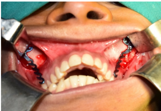
Fig. 1: Zygomatic implant surgery under Local Anaesthesia

Zygomatic implant (Figure 1) surgery was conducted using local infiltration anaesthesia bilaterally. Incision was taken to reach the zygomatic buttress area. The 'L' shaped implant from 'BK Surgical' was contoured according to bone morphology and attached using three bone screws.