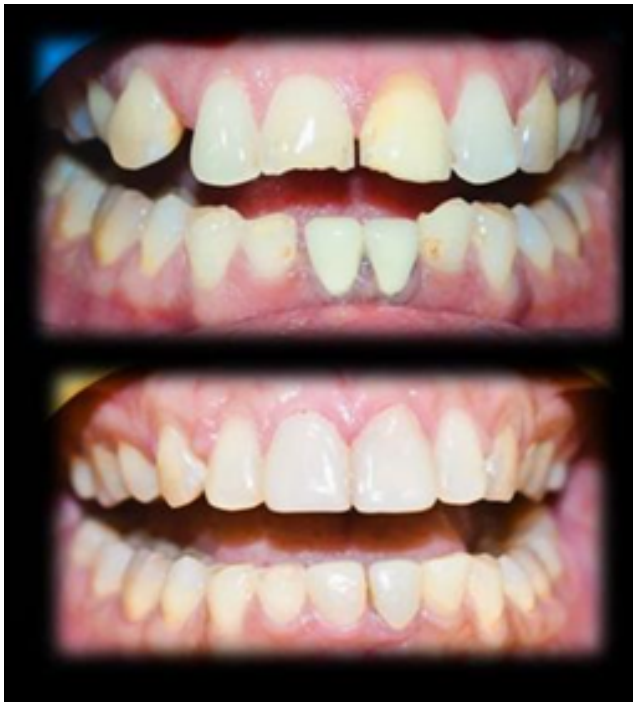
Fig. 4: Before and after treatment images depicting aligned and aesthetic teeth.