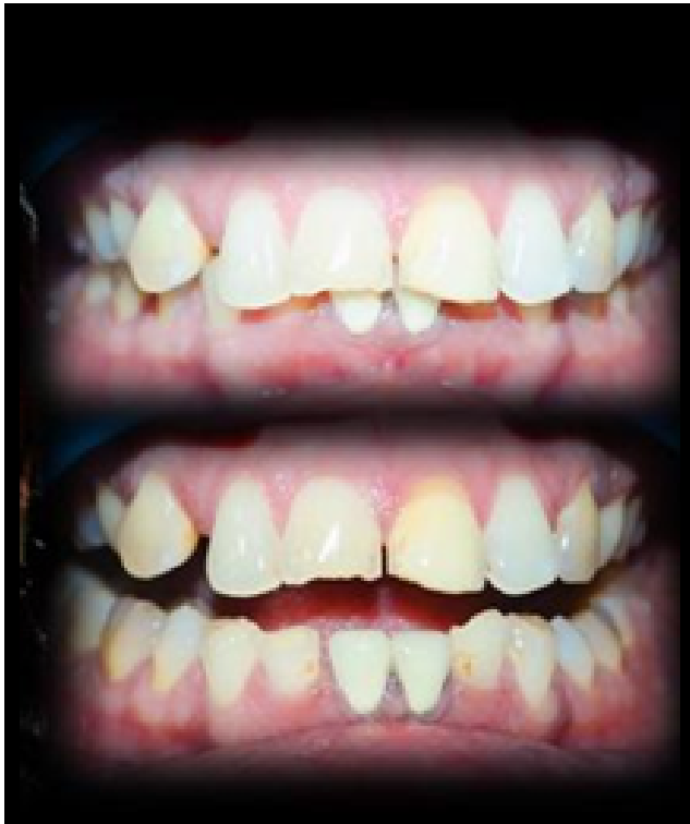
Fig. 1: Spacing, broken and discoloured anterior teeth.

A 54-year-old female patient reported to the clinic with the chief complaint of an unpleasant smile. On intraoral examination, she had protrusion, irregular, broken, and discoloured anterior teeth. Spacing was distal to the upper right lateral incisor. (Figure 1) Extraoral analysis, showed a convex facial profile. (Figure 2)