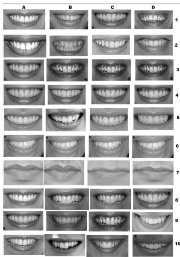
Fig. 2: The comparisons of smile perceptions between the two professionals for each options.

The second component of smile is Maxillary central incisors ratio and symmetry. 75% W/H ratio widely accepted by women, whereas 85% ratios widely accepted by men and is considered more esthetic. The results of our study clearly shows its relevance to the existing literature view. 10 Any deviation in maxillary central incisor asymmetry was identified as unesthetic by both dental and other professionals. Symmetry between incisal edges is considered to be one of the important factor determining the esthetics. 11