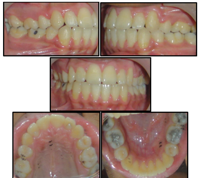
Fig. 8: Post treatment intraoral photographs