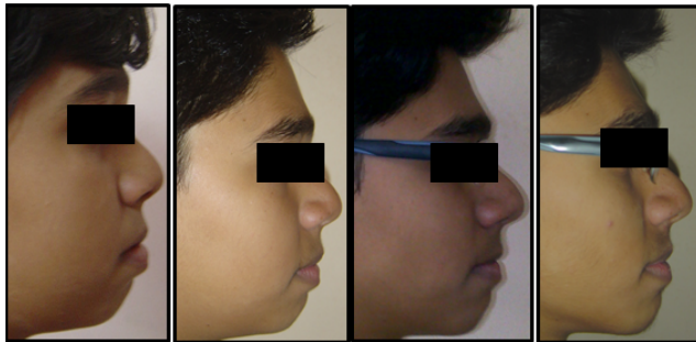
Fig. 9: Comparison of pre, mid, pre finishing and post treatment profiles

protrusion might have any number of a combination of the skeletal and dental component. Hence, identifying and understanding the etiology and expression of Class I malocclusion and identifying differential diagnosis is helpful for its correction. The patient's chief complaint was forwardly placed upper and lower front teeth with excessive show of front teeth. The case was of a clearcut bimaxillary dentoalveolar protrusion with severely proclined upper and lower anterior dentition. The selection of orthodontic fixed appliances is dependent upon several factors which can be categorized into patient factors, such as age and compliance, and clinical factors, such as preference/familiarity and laboratory facilities. The execution of all 1 st premolar extraction followed by Fixed appliance therapy appropriately resulted in an improvement in the patient's convex profile in this case. The most important point to be highlighted here is the decision to extract the premolars. After analysing the case thoroughly and reading all pretreatment cephalometric parameters along with evaluating the patients profile clinically, a decision was made of extracting the 1 st premolars. Proximal stripping with retraction and closure of spaces could not