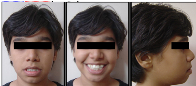
Fig. 1: Pre treatment extraoral photographs

A 15 year old male patient presented with the chief complaint of forwardly placed upper and lower front teeth and excessive show of front teeth. On Extraoral examination, the patient had a convex facial profile, grossly symmetrical face on both sides with a retruded chin, potentially incompetent lips, moderately deep mentolabial sulcus and an acute Nasolabial Angle, a Mesoprosopic facial form, Dolicocephalic head form, Average width of nose and mouth, minimal buccal corridor space, a consonant smile arc and slightly anterior divergence of face. The patient had no relevant prenatal, natal, postnatal history, history of habits or a family history. On Smiling, there was excessive show of maxillary anterior teeth. The patient had a toothy smile. On smiling the patient showed the presence of acrowded anterior dentition and an unaesthetic facial profile with a toothy smile.