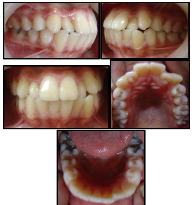
Fig. 2: Pre treatment intraoral photographs

Intraoral examination on frontal view shows presence of an average overjet and overbite with the lower dental midline shifted slightly to the left of the patient by 1mm. On lateral view the patient shows the presence of Class I incisor relationship, a Class I Canine relationship bilaterally and a Class I molar relationship bilaterally. There was slight crowding in the upper arch with presence of instanding lateral incisors and severely protruded upper and lower anterior dentition. The upper and lower arch showed the presence of a U shaped arch form. Also the patient showed presence of a bilateral single tooth crossbite with the right and left lateral incisors. Also the right and left lateral incisors showed the presence of a Talons cusp on occlusal view