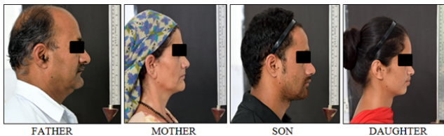
Fig. 2: Profile Photographs of family