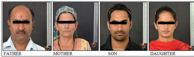
Fig. 1: Frontal Photographs of family