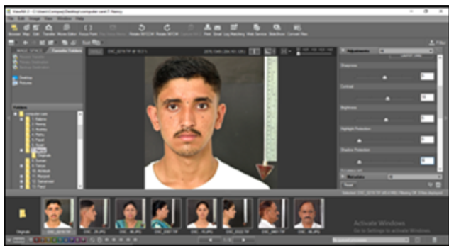
Fig. 3: Nikon View NX2 Software