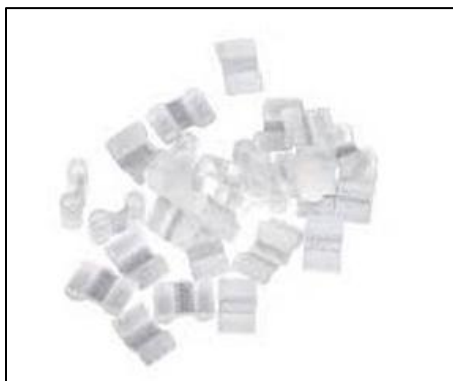
Fig. 2: Dumbbell separator