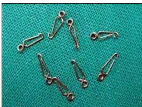
Fig. 3: Kesling separator