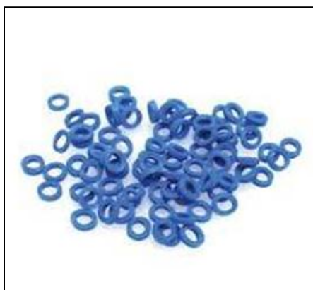
Fig. 1: Elastomeric separator

The amount of separation achieved by each separator was measured with a feeler gauge. The amount of separation was recorded and the duration to achieve required separation (0.2 mm) was also noted. Data thus obtained was subjected to statistical analysis. P<0.05 was considered to be statistically significant. Statistical analysis was done using SPSS software (SPSS Inc., version 15.0, Chicago, IL, USA).