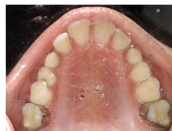
Fig. 5: Bands fabricated on the first permanent molars

In the next appointment, after 3 days, the child was friendly, and not scared by the procedure. He was pre-informed about each step and his permission was taken before every step. The bands were fabricated on the first permanent molars followed by the impressions of the upper and the lower arches. A hand puppet, in shape of a policeman, was given to the child to keep on his hand. He was also asked to make a story with the puppet for the next appointment. This was a gift to the child for his good behaviour during the appointment.