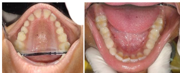
Fig. 2: V-shaped maxillary and U-shaped mandibular arches

Extraoral examination revealed a straight profile and a clean right thumb with short nail and callus formation. On intraoral examination, V-shaped upper and U-shaped lower arches were seen and the placement of thumb was adjacent to the first and the second primary molars. The treatment plan was made to stop the thumb sucking habit followed by correction of the proclination and spacing present in the upper and lower arches. The treatment was made to correct the habit of thumb sucking followed by fixed orthodontic treatment for the correction of the malocclusion.