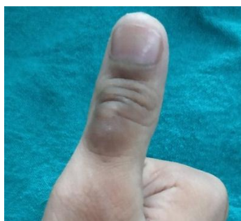
Fig. 4: Clean, short nailed thumb with callus formation

In the next appointment, after 3 days, the child was friendly, and not scared by the procedure. He was pre-informed about each step and his permission was taken before every step. The bands were fabricated on the first permanent molars followed by the impressions of the upper and the lower arches. A hand puppet, in shape of a policeman, was given to the child to keep on his hand. He was also asked to make a story with the puppet for the next appointment. This was a gift to the child for his good behaviour during the appointment.