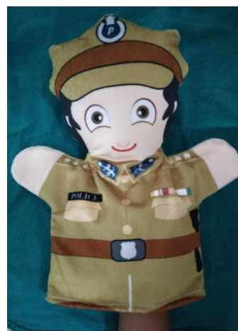
Fig. 6: Hand puppet

The child was recalled after 2 days and a modified bluegrass appliance was given to the child. It was checked that the beads were placed to the most palatal part, not touching the palate or the tongue. The instructions were given to roll the beads by tongue instead of thumb sucking until the next appointment. The child was recalled after 10 days.