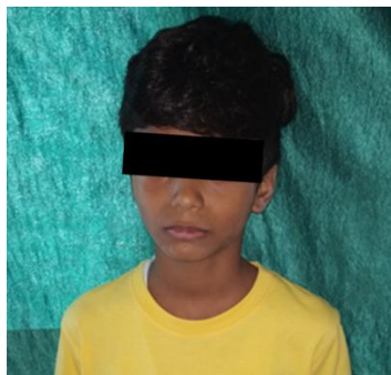
Fig. 1: Thin and quiet child

Extraoral examination revealed a straight profile and a clean right thumb with short nail and callus formation. On intraoral examination, V-shaped upper and U-shaped lower arches were seen and the placement of thumb was adjacent to the first and the second primary molars. The treatment plan was made to stop the thumb sucking habit followed by correction of the proclination and spacing present in the upper and lower arches. The treatment was made to correct the habit of thumb sucking followed by fixed orthodontic treatment for the correction of the malocclusion.