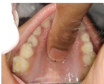
Fig. 3: Position of thumb in mouth