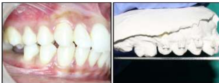
Fig. 5: (Right side), A – Pretreatment photograph. B – Supra-erupted upper right molar.