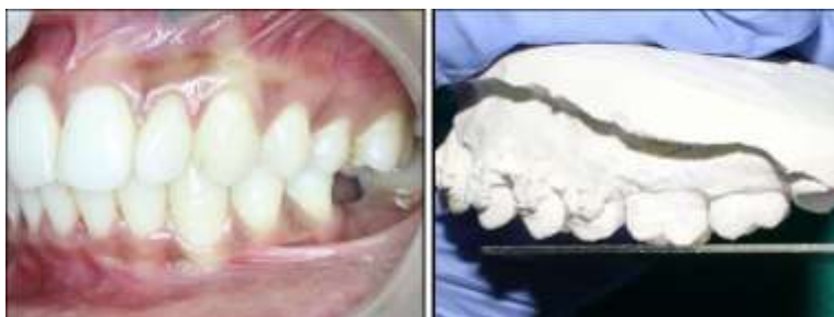
Fig. 6: (Left side), A – Pretreatment photograph. B – Supra-erupted upper left molar.