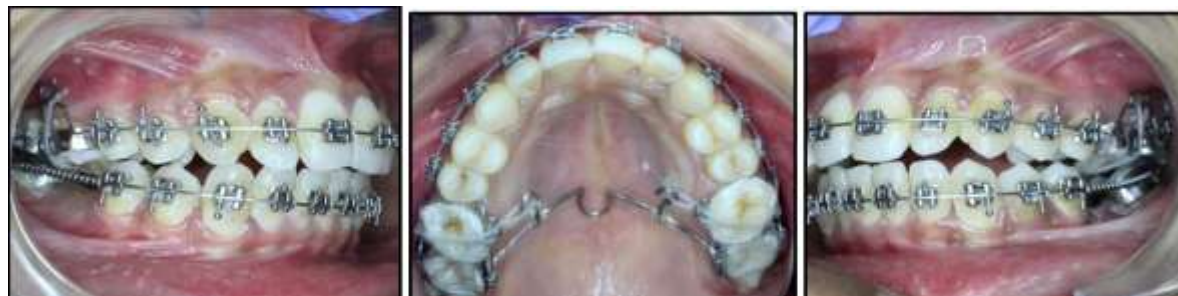
Fig. 4: For intrusion, elastomeric chain was attached from helix of rectangular S.S. wire, involving the welded button on buccal side then crossing over the occlusal surface of the over-erupted first molar to the welded button on the palatal side.