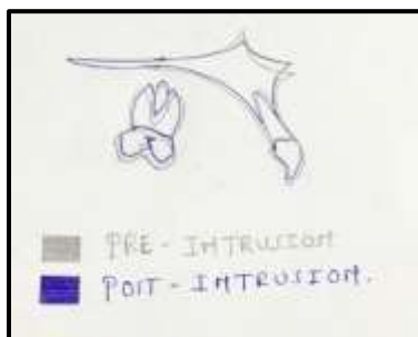
Fig. 11: Amount of intrusion was measured by superimposing pre and post-intrusion lateral cephalograms