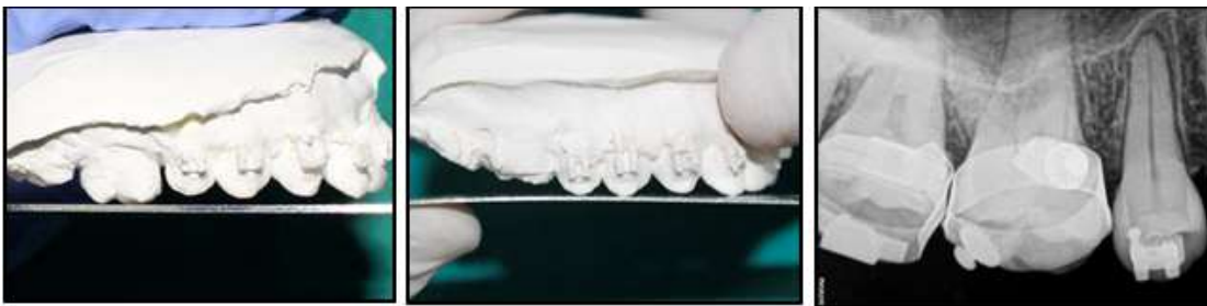
Fig. 9: (Right side) Comparative photographs of before and after intrusion on study models and RVG