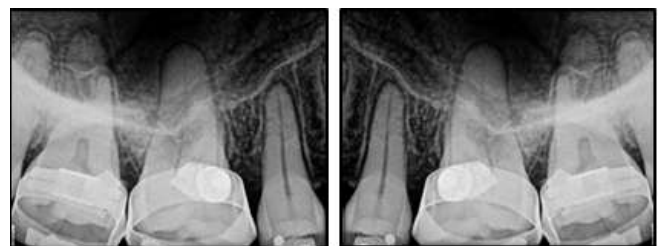
Fig. 12: No evidence of root resorption was appreciated radiographically on RVG.

comparing pre and post intrusion photographs, study models, and RVG (Fig. 7-10). Amount of intrusion was measured by superimposing pre and post-intrusion lateral cephalograms. 3mm of intrusion was achieved within 2 months of span (Fig. 11). No evidence of root resorption was appreciated radiographically on RVG (Fig. 12). No ill-effects were observed in the surrounding gingival tissues and bony structures.