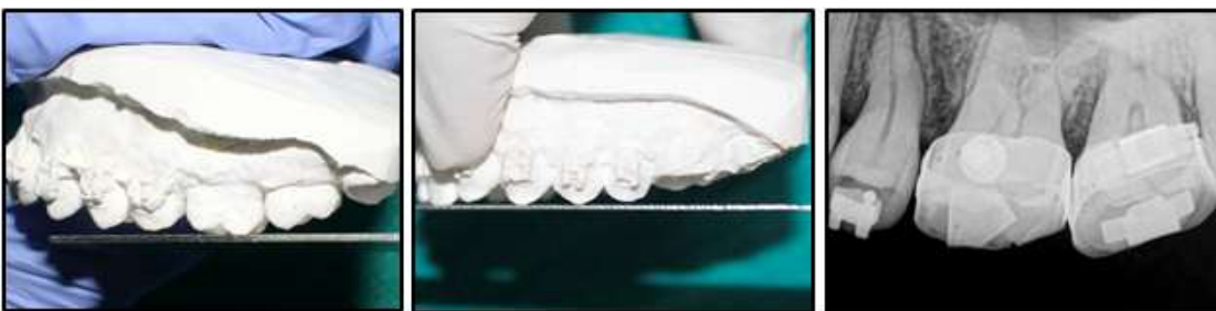
Fig. 10: (Left side) Comparative photographs of before and after intrusion on study models and RVG