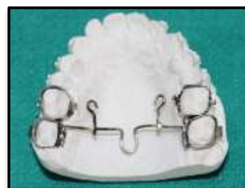
Fig 2: Intrusion arm with open helix soldered to TPA