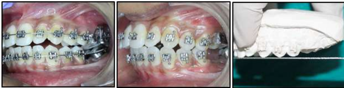
Fig. 8: (Left side), A – Intrusive force applied, B- Post intrusion photograph, C- Post intrusion study model of left side