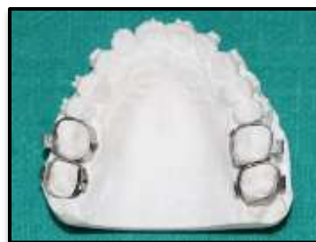
Fig. 1: Molar bands transferred to study cast

6. For intrusion, elastomeric chain (E – chain) was attached from helix of rectangular S.S. wire, involving the welded button (on buccal side), then crossing over the occlusal surface of the over-erupted first molar to the welded button on the opposite side (on palatal side), carried further to the opposing open helix which is soldered to TPA. (Fig. 4).