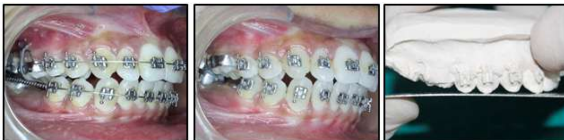
Fig. 7: (Right side) A – Intrusive force applied, B- Post intrusion photograph, C- Post intrusion study model of right side