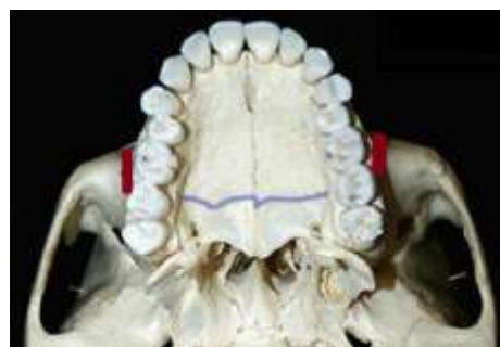
Fig. 2: Diagram representing the infra zygomatic crest region.

Lin et al. 8 stated infra zygomatic crest lies higher and lateral to first and second molar region. They preferred bone screw placement in first and second molar region, closer to mesiobuccal root of first molar. In adults, it is above maxillary first molar while in young person it is in between second premolar and first molar.