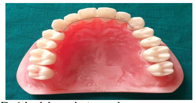
Fig. 6: bonded premolar to premolar

3. Banded molar –molar retainer:-The molar to molar mandibular retainer is made by the heavy gauge wire soldered on the molar bands. It allows the mandibular canines and molars to settle naturally and maintain the arch <sup>12</sup>