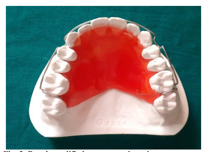
Fig. 3: Begg's modified wraparound retainer

It is generally used in cases with anterior spacing and can also be used to realign mandibular incisor if mild crowding develop after the treatment.