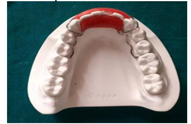
Fig. 2: clip on retainer