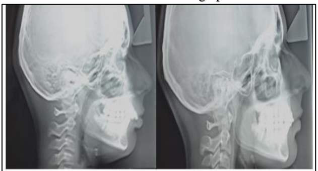
Pre- treatment & Post -treatment Cephalogram