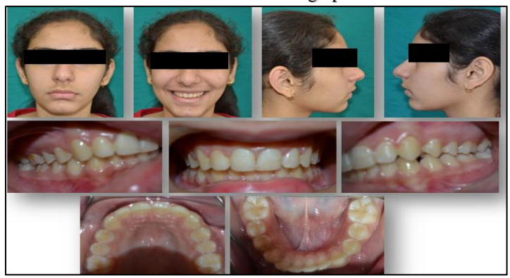
Post- treatment Photographs