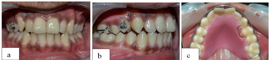
Fig 3: Photograph of the patient after 2 months of active appliance therapy a) Front view b) Right buccal view. c) Occlusal view