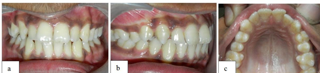
Fig 1: Pre-treatment photograph showing scissor bite irt 14 a) Front view b) Right lateral view c) Occlusal view

The scissor bite that was present in the patient was dento-alveolar type and since the patient was not willing for fixed orthodontic treatment, the correction of the scissor bite was planned to be done by using a removable orthodontic appliance.