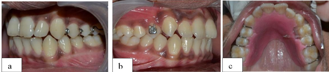
Fig 2: Appliance design a) Left lateral view showing retentive components of appliance b) Right lateral view of the patient showing bonded bracket i.r.t 14 c) Occlusal view with rectangular portion of acrylic trimmed from first premolar region

A retention plate was given to the patient which comprises of labial bow extending to the first molar tooth (Fig 4 a,b).