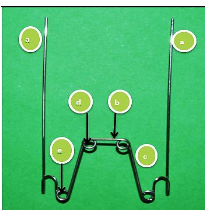
Fig. 1: The Quad Helix Expander