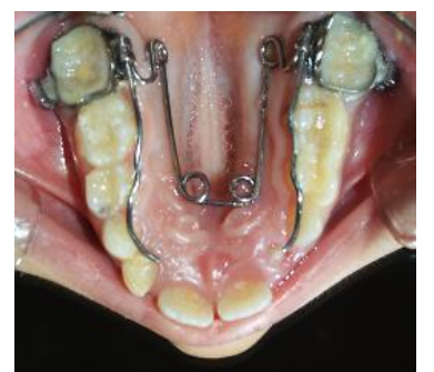
Fig. 5: The Quad Helix inserted in palatal sheath and the arch arms contacts all posterior teeth