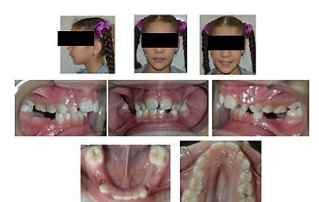
Fig. 3: Case presented after expansion