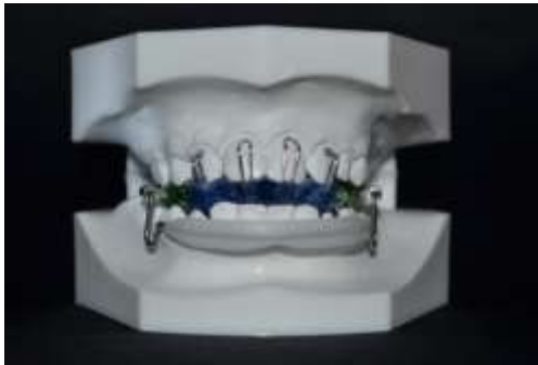
Fig. 1: Teuscher activator with lip bumper

aspect was performed to encourage the eruption of teeth. Patients and their parents were instructed to wear the activator at least 12 per day. When the treatment goals had been met and stability seem secured, patients were informed to wear the activator at night as a retainer and gradual reduction in the wearing hours was done Fig. 3 and 4.