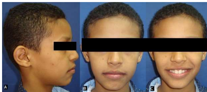
Fig. 4: Post-treatment extraoral photographs A) lateral view B) frontal view C) smile view