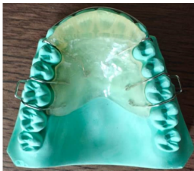
Figure 1: Hawley retainer

2.1.1.1. Fabrication. Hawley retainer is fabricated with acrylic resin that covers the palate, a labial bow made up of stainless-steel contoured on the labial surface of maxillary anterior teeth, and consists of U loops extending from distal surface of canines and finally the wire adapted through canine and premolar to palate and is inserted into acrylic resin plate. 11 Along with labial bow it also consists of clasps like Adams clasp, circumferential clasp or ball-end clasp, for retention of appliance. The canine loops should be kept 2-3mm above the gingival margin and away from gingival tissue to prevent soft tissue injury. Labial bow is kept passive with gentle contact on anterior teeth. The acrylic plate can be fabricated from heat-cure or self cure resin. The thickness of plate is 2-3 mm so that it can retain wire components and also comfortable to the patient. 12 Distally it extends till the distal aspect of first molars, and is thinned to merge with the palatal mucosa.