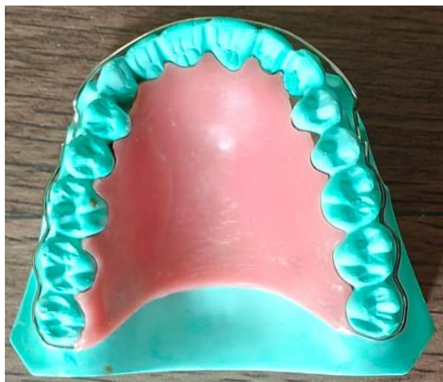
Figure 3: Wrap around retainer

In this appliance the labial bow wire extends to the posterior teeth, without molar retentive clasps 15 (Figure 3). It is useful in patients where treatment is done with extraction of teeth. The long extended wire is prone to distortion and mishandling during fitting and removal of appliance. Therefore Patients are instructed to remove it from the palatal acrylic plate with the help of thumb or forefinger, and experienced patients may also use their tongue. It is also advised to add acrylic on the labial bow to enhance its stability and prevent potential distortion. 16