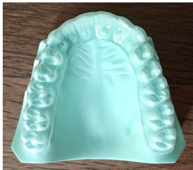
Figure 4: Essix retainer