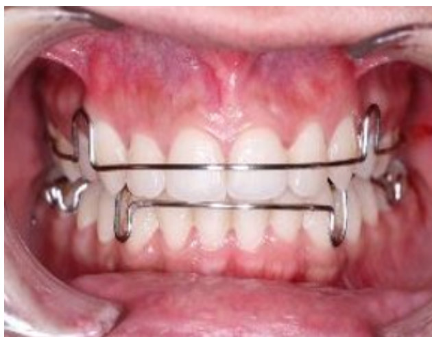
Figure 2: Intra oral view of Hawley retainers