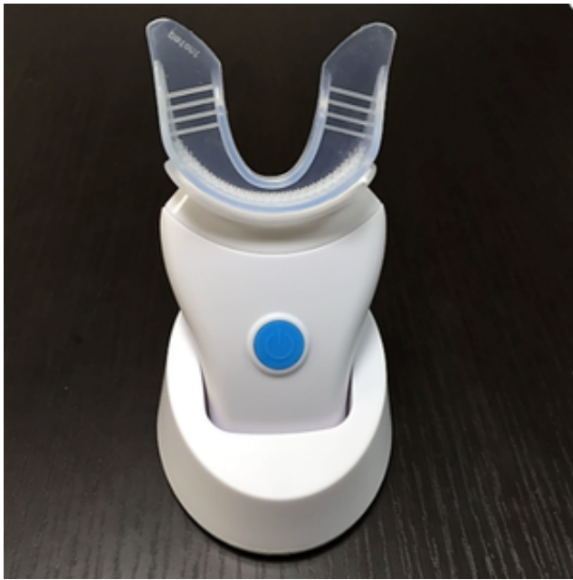
Fig. 1: Dental vibrator

To accelerate tooth movement, physical and pharmacological approaches can be used. Physical approach includes low-energy laser irradiation 9 and magnetic fields, 10,11 Transcutaneous electrical stimulation (TENS) and pharmacological approaches includes injection of prostaglandin E2 (PGE2) and 1,25-(OH)2D3 during tooth movement. However, many side effects, such as local pain, severe root resorption, and drug-induced side effects have been reported.