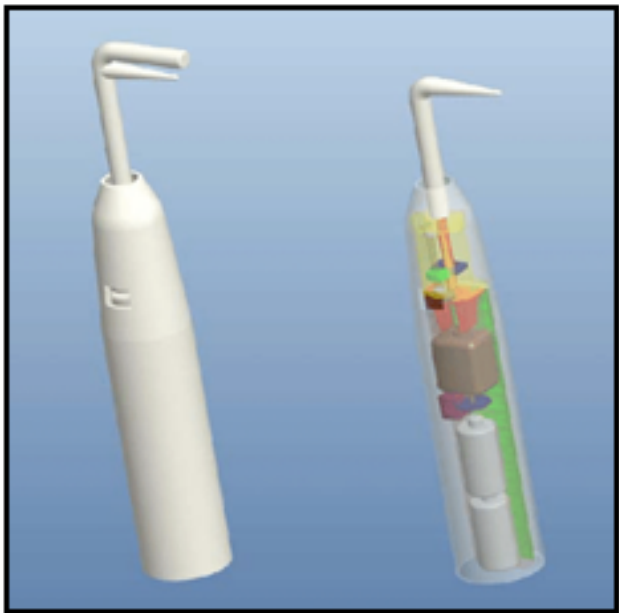
Fig. 3: Structure of vibrator

of teeth square measure scanned with special intraoral scanner and a digital model is produced, the doctor then sees a malpositioned tooth, changes the position in the computer, the information is distributed mechanically to the company which activates the robot to manufacture a pre-adjusted wire. This, in turn, will be sent back to the participant dentist to be delivered to the patient mouth. Dr. Saschdeva states that “the treatment planning software has several practical components: 3D visualization, measurement, communication, decision creating with simulation, bracket placement, setup and archwire design, quality and outcome assessment, and SureSmile patient management. Each of these utilities used either singularly or in combination enables the doctor to build higher advised decisions and style the targeted prescription archwire”. According to his statements, it will take a motivated and old dentist a minimum of 2 years and therefore the completion of at least 100 patients to develop ability in treating with SureSmile. However, we believe that the orthodontic community would be interested to visualize unbiased strong level of evidence studies showing that teeth will be moved quicker, better, and more with efficiency with SureSmile technology. 9