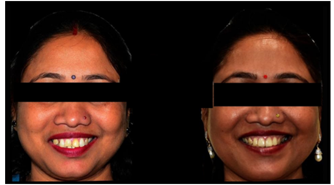
Fig. 5: Before and after treatment with a pleasant smile.

teeth, pleasing aesthetics, normal function with reasonable stability. 9 The evaluation of sagittal relationship has been a significant problem in the field of orthodontics, due to the factors affecting the measuring angles which have prime importance in diagnosis and treatment planning of the case. ANB angle has been the most commonly used measurement for assessing sagittal jaw discrepancies. The angle value ranges from 2-4 degrees to 0-4 degrees. 10