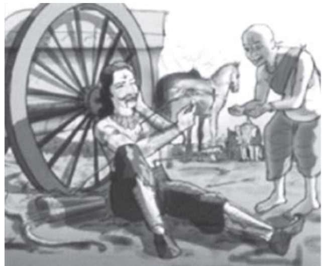
Fig. 1: Karna donating his gold-filled tooth during the epic of Mahabharata 2