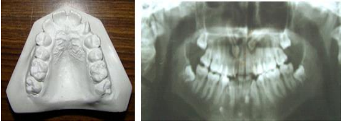
Fig. 1: Bilateral PDC subject: Cast and OPG