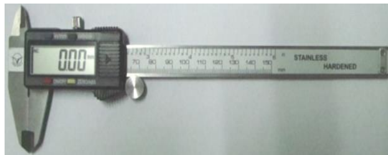
Fig. 3: Digital Vernier Calliper (Indian Aeronautics Limited)

The M-D and B-L widths of all the erupted permanent teeth mesial to second molars were measured directly on plaster casts using a Digital Vernier Calliper (Fig. 3). Teeth that were not fully erupted were excluded and measurements were not carried out where caries or restorations obscured one of the surfaces. Measurements were obtained on both sides of the dental arch.