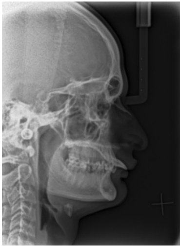
Fig. 6: Pretreatment lateral cephalogram