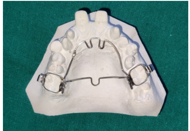
Fig. 3: Modified TPA appliance