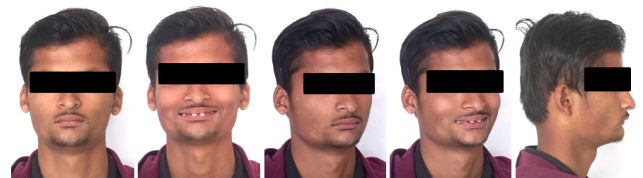
Fig. 1: Pretreatment extraoral photographs

A male patient aged 17 years came to the Department of Orthodontics and Dentofacial Orthopedics with a chief complaint of forwardly placed upper front teeth. Profile was convex with deep mentolabial sulcus, competent lips and straight facial divergence (Figure 1).