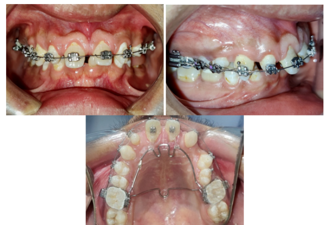
Fig. 4: Progress after 3 months after the modified appliance is ligated in mouth

This modified transpalatal appliance had helped in improving the inclination of maxillary central incisors in around 3 months which plays a major role in esthetic appearance of the patient. The modification is further used in correcting the rotations of the teeth. The appliance was versatile and can be modified according to the patient’s