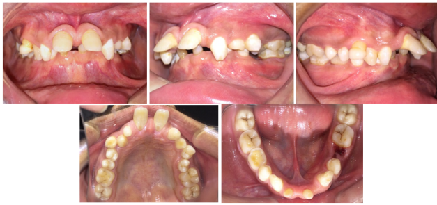
Fig. 2: Pretreatment intraoral photographs