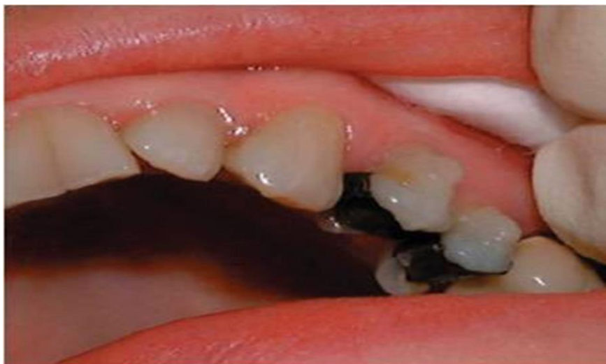
Fig. 2: Showing vertical Bar to the buccal surface for greater rotation and angulation control