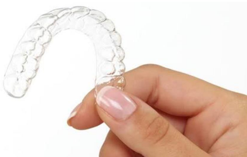
Fig. 3: Showing patient start-up and care kit with full set of aligners