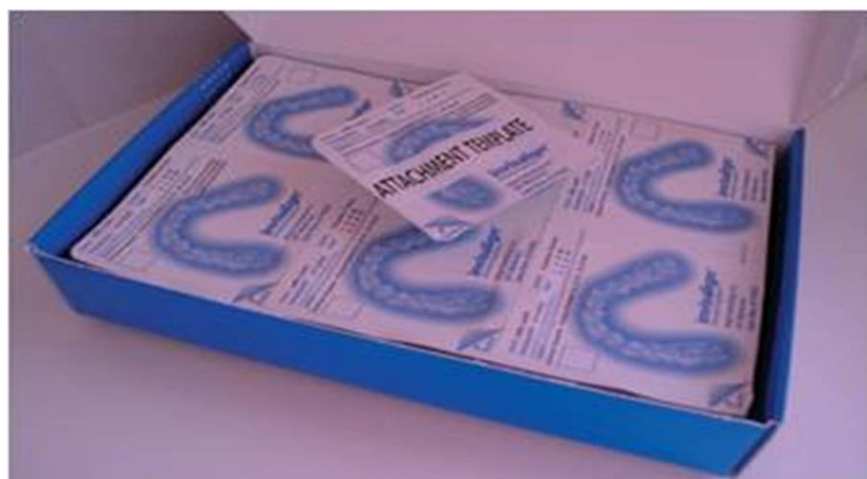
Fig. 4: Showing pressure formed Aligners