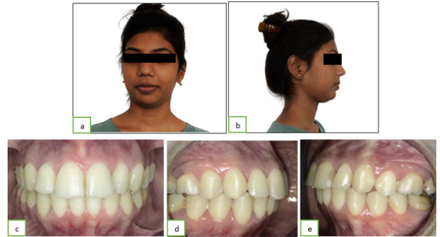
Fig. 5: Post-treatment photographs

Angles Class I canine relationship was achieved bilaterally with well-coordinated upper and lower arches. Significant reduction in dentoalveolar protrusion was seen due to retraction of upper and lower anterior completely into the extraction spaces (Figure 5).