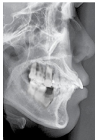
Fig. 3: (Lateral Cephalogram)

The IMPA (incisor mandibular plane angle) of (100°) reflected the proclination of lower incisors. There were no significant signs or symptoms of temporomandibular disorders. (Figure 3)