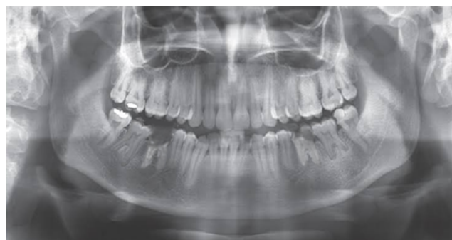
Fig. 2: (Orthopantomogram)

No bone pathology and a normal morphology of condyle was observed in panoramic radiograph. All permanent teeth are present including all four wisdom teeth, there is also presence of severe decay on the mandibular right and left first molar i.e. (3-6, 4-6). (Figure 2).