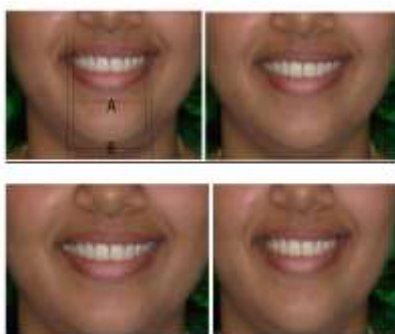
Fig. 1 Graph 1: Smile attractiveness related to buccal corridor width as judged by laypersons.

This indicates that both the laypersons and orthodontists prefer smiles that are visibly filled with the teeth between both the commissures. The Smiles in subjects who had large buccal corridor space were considered as less attractive by both the groups.